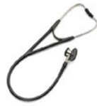
■ 5079-125 Harvey™ Elite® Stethoscope, Black