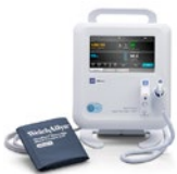
Welch Allyn® Spot Vital Signs® 4400 Device with SureBP Non-invasive Blood Pressure and SureTemp Plus Thermometer