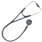
■ 5079-271 Harvey™ Elite® Stethoscope, Navy