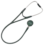
■ 5079-284 Harvey™ Elite® Stethoscope, Forest Green