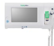
Welch Allyn Connex® Spot Monitor with SureBP Noninvasive Blood