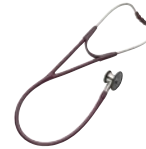
■ 5079-270 Harvey™ Elite® Stethoscope, Burgundy